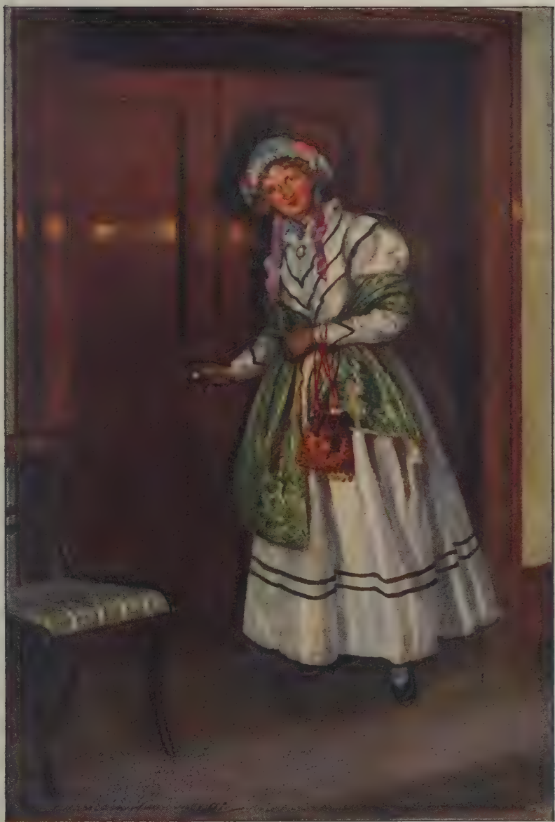
SHE CAME OUT OF MY ROOM, COMPARATIVELY SPEAKING, LOVELY